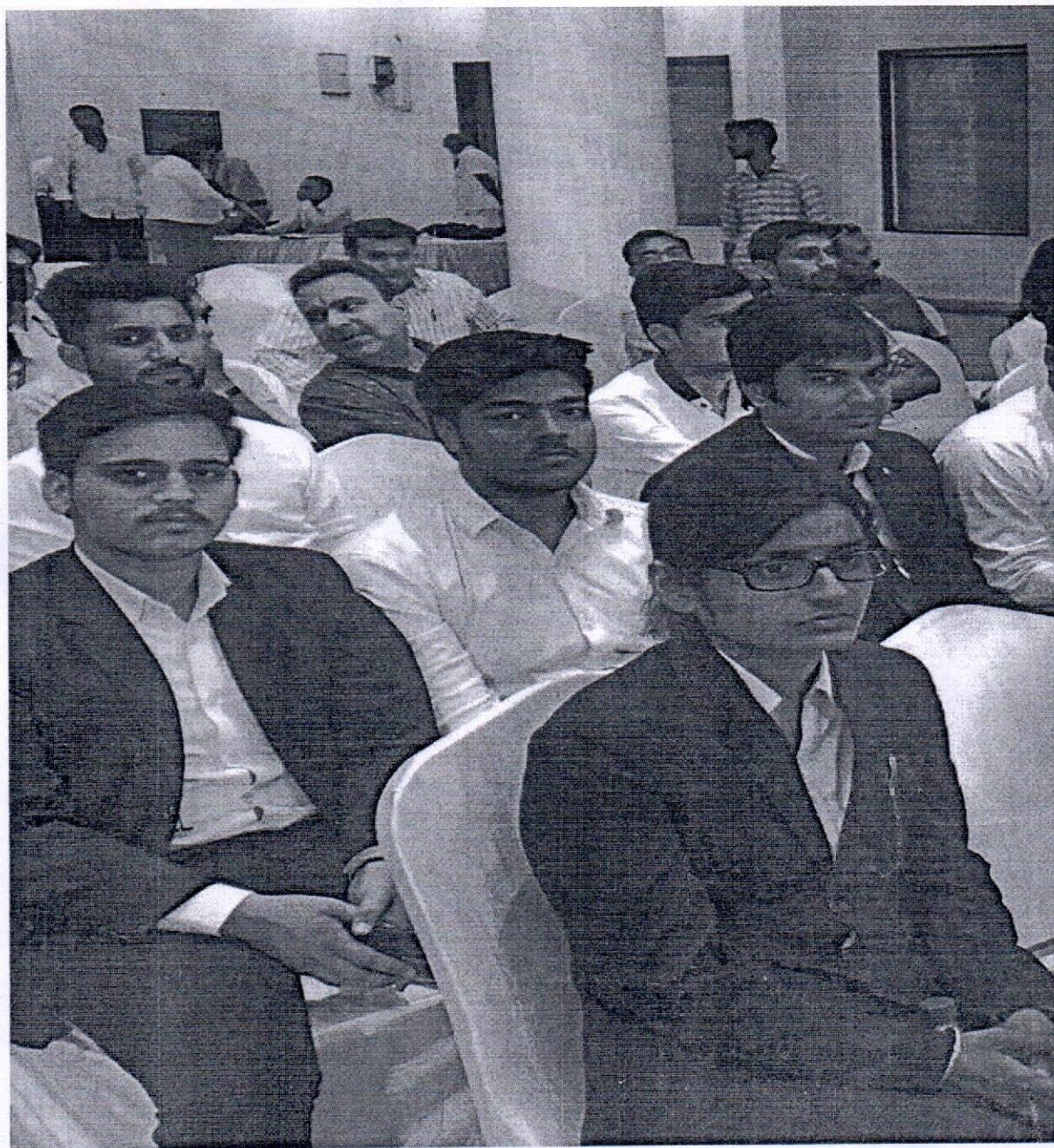
STUDENTS ATTENDING GUEST LECTURE ON: INTELLECTUAL PROPERTY RIGHTS: INDIAN PERSPECTIVE AS ON 17 th SEPTEMBER, 2018